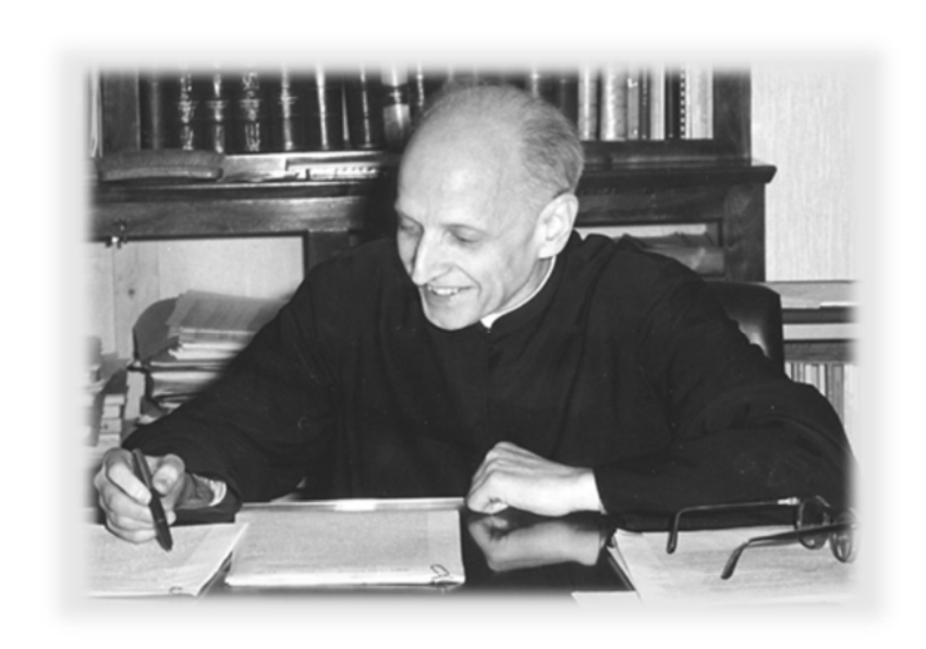
SPONSORED BY: THE ZIMMERMAN FAMILY FOUNDATION & THE JOHN TEMPLETON FOUNDATION